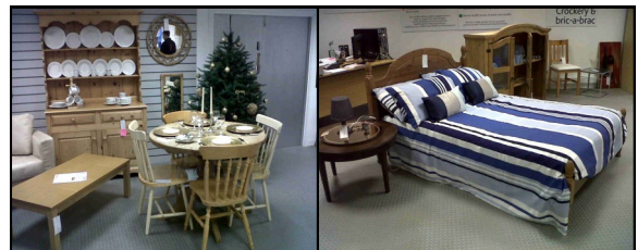
Room settings at Reviive, Battlefield Enterprise Park, Shrewsbury