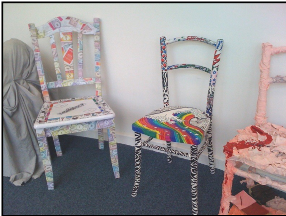
A selection of the funky chairs created by Ludlow College students during the Funky Furniture project—a collaboration between SSFS and the college